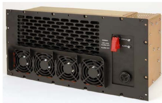
Figure 2 ECU-Chill 550 Refrigeration Based Cabinet Cooler

24 St. Martin Dr., Marlborough, MA 01752