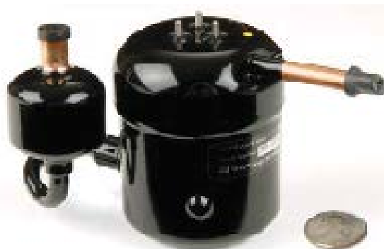
Figure 1 Aspen's Miniature Compressor Enables Small Environmental Control Units

Over 1000 of these systems have been in use on SOCOM MRAPS for over 2 years. The reliability and effectiveness of this system is demonstrated by its over 90,000 hour MTBF, and maintenance free design.