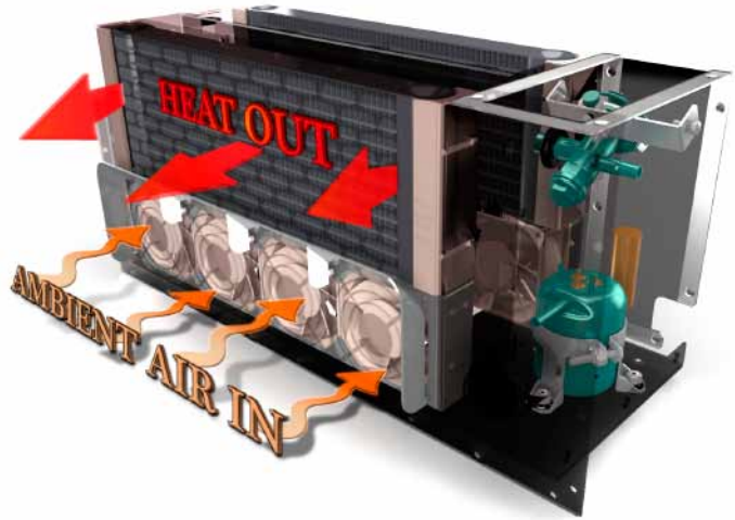
Electronics Remain Sealed in Cooled Environment

* When installed in a qualified military transit case